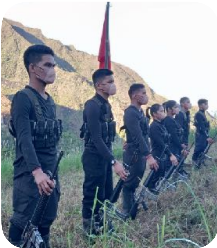
NPA fighters from North Central Mindanao stand in attention to render a 21-gun salute for Ka Joma

As the advanced detachment of the proletariat, the CPP has made great achievements in its ideological, political and organizational work. It has been guided by the theory and practice of Marxism-Leninism-Maoism and has applied it on the history and current social circumstances of the Filipino people, It has put forward the general line of people's democratic revolution with the strategic line of protracted people's war and with the socialist perspective. It has upheld the principle of democratic centralism and has built a nationwide organization that is well integrated with the toiling masses of workers and peasants and the rest of the people.